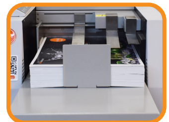
▲ Omni-Flow 330 (SRA3)