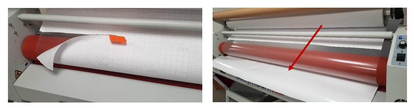
6. Cut through just the backing paper using the snitty [cutting tool] provided. Once cut, loosen the backing all the way along the film, pull down from the middle and drape over the feed table.

5. Move towards the rear of the system and pull the laminate tight from the middle towards you, while holding lower the laminating roller by turning the handle clockwise. When the two rollers meet the handle will go loose, using one finger flick the handle clockwise. Using too much pressure can cause a wave in the middle of the laminate.