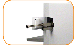
Cross perforation bar