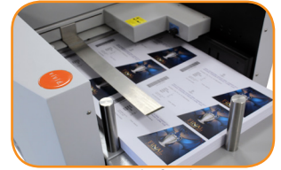
Deep pile feeder