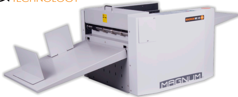
▲ MC-35 (optional stand available)