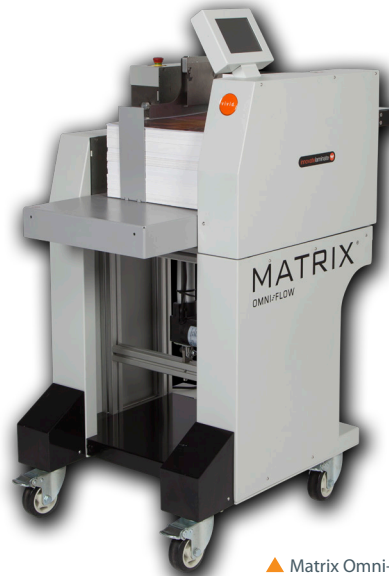
▲ Matrix Omni-Flow Feeder