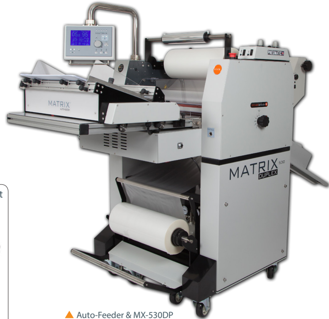
▲ Auto-Feeder & MX-530DP

Feed prints for lamination, foiling & spot UV-style effects, the Matrix becomes a truly automated print finishing system.